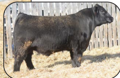
RIVERSTONE FASTPASS 69C Maternal Grandsire to Lot 12