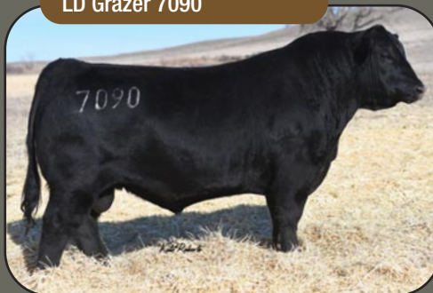
LD Grazer 7090

LD Grazer 7090 was selected by Musgrave Angus as the next generation of their program. Grazer brings forward an incredible look, being thick made, big bodied, easy fleshing and bold throughout. Grazer captures all the sought after attributes of the Payweight line and adds extra power, impeccable feet and the elite Upward 307R maternal line.