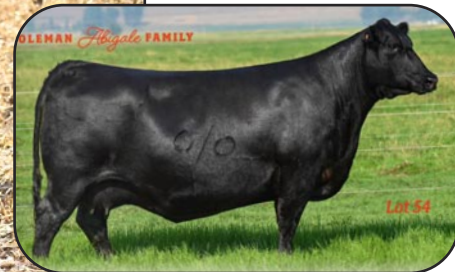
COLEMAN ABIGALE 7185 Dam of Lot 5