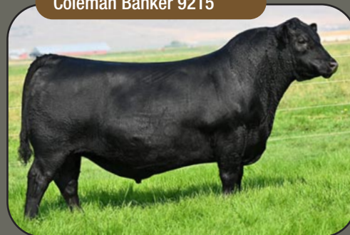
Coleman Banker 9215

Coleman Banker 9215 was the $75,000 top-seller through the 2021 Coleman fall production sale. He was the second heaviest bull in his contemporary group and was the No. 1 ADG Bull on Test and had an actual birth weight of 75 lbs. The combination of this tremendous gain makes him one of the tremendous calving-ease sires ever produced in the Coleman Angus program.