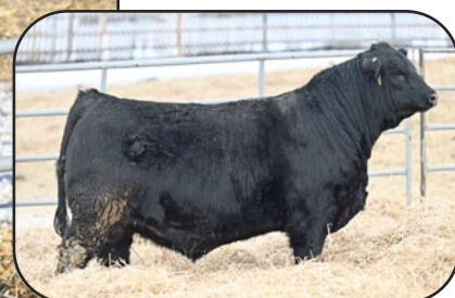
RIVERSTONE SPLASH 10K Paternal Brother to Lot 24