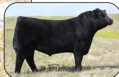
HF REBEL 53Y Maternal Grandsire to Lot 14