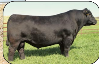
SAV WEST RIVER 2066 Maternal Grandsire to Lot 9