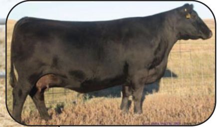
S A V EMBLYNETTE 9811 Dam of Lot 3 & 4