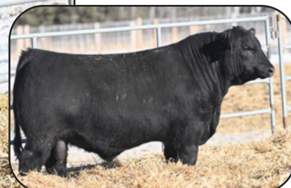
RIVERSONTE DEVIN 89K Paternal Brother to Lot 20