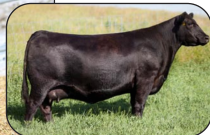
BROOKING BEAUTY 6051 Paternal Granddam to Lot 16 - 18