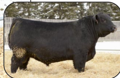
RIVERSTONE OUTLAW 24F Paternal Brother to Lot 28