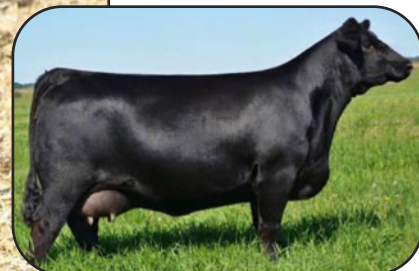
BAR-E-L ERICA 74A Paternal Granddam to Lots 19 & 20