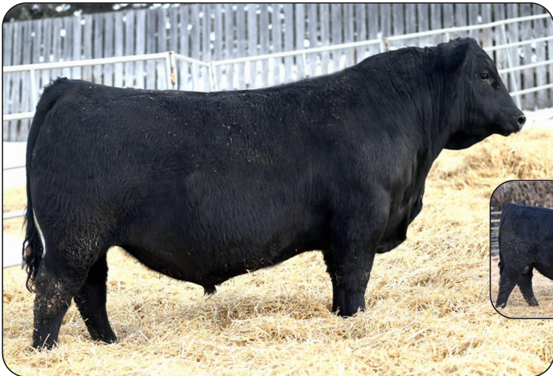
KT AMERICA 2128 Full Brother to Lot 2