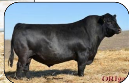
BASIN PAYWEIGHT Paternal Grandsire to Lot 25