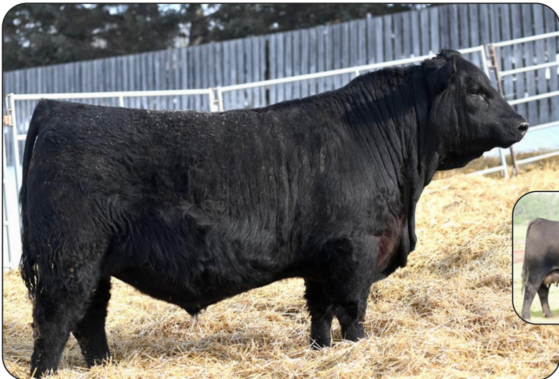
HIGHLAND BOSTA BLACKBIRD 3Z Dam of Lot 1