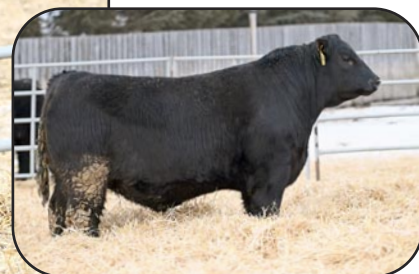
RIVERSTONE GRAZER 70K Paternal Brother to Lot 23