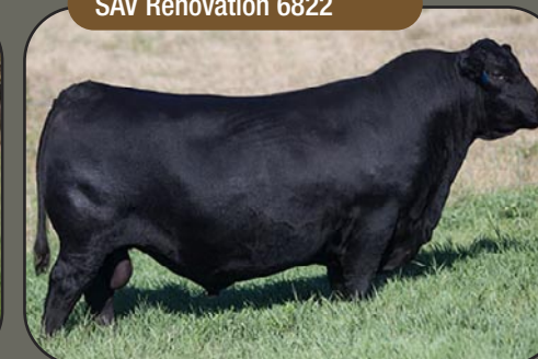
SAV Renovation 6822

Renovation has been very popular with breeders who have seen him and admired his overall balance and eye appeal. He is a stout, attractive bull out of an excellent Density dam. His progeny reports include added performance and thickness in the bulls and attractive maternal look to his females.