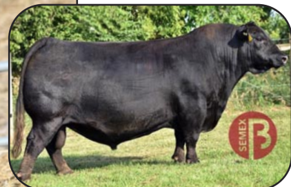
MUSGRAVE COLOSSAL 137 Maternal Grandsire to Lot 26