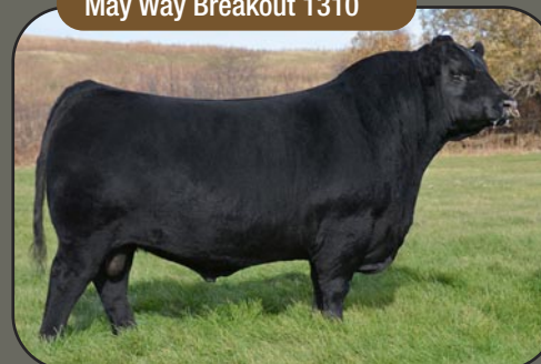
May Way Breakout 1310

Breakout 1310 was one of the most talked about bulls in 2015, when he won the Royal Bank Beef Supreme Challenge over all breeds at Agribition. The Breakout progeny have both style and performance and a bull that samps a solid pattern to his calves. He has been used extensively in the Hamilton Farms, Six Mile and Popular Meadow programs.