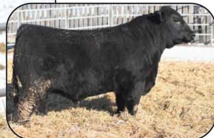
RIVERSTONE INTERESTED 64K Maternal Brother to Lot 11