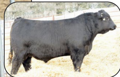
RIVERSTONE RESOURCE 51D Maternal Grand sire to Lot 17