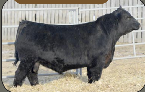
Riverstone Sensation 16H

Riverstone Sensation 16H was a bull that we kept for our heifer pen! This herdsire was off the charts in terms of calving ease because of his streamlined makeup and smooth shape and skeleton. When we first used him on first calvers it was to get them out trouble free but wow were we surprised when those calves put on the pounds and had comparable performance with some of our top AI cow bulls. We lost this bull last spring so the progeny from this guys is limited.