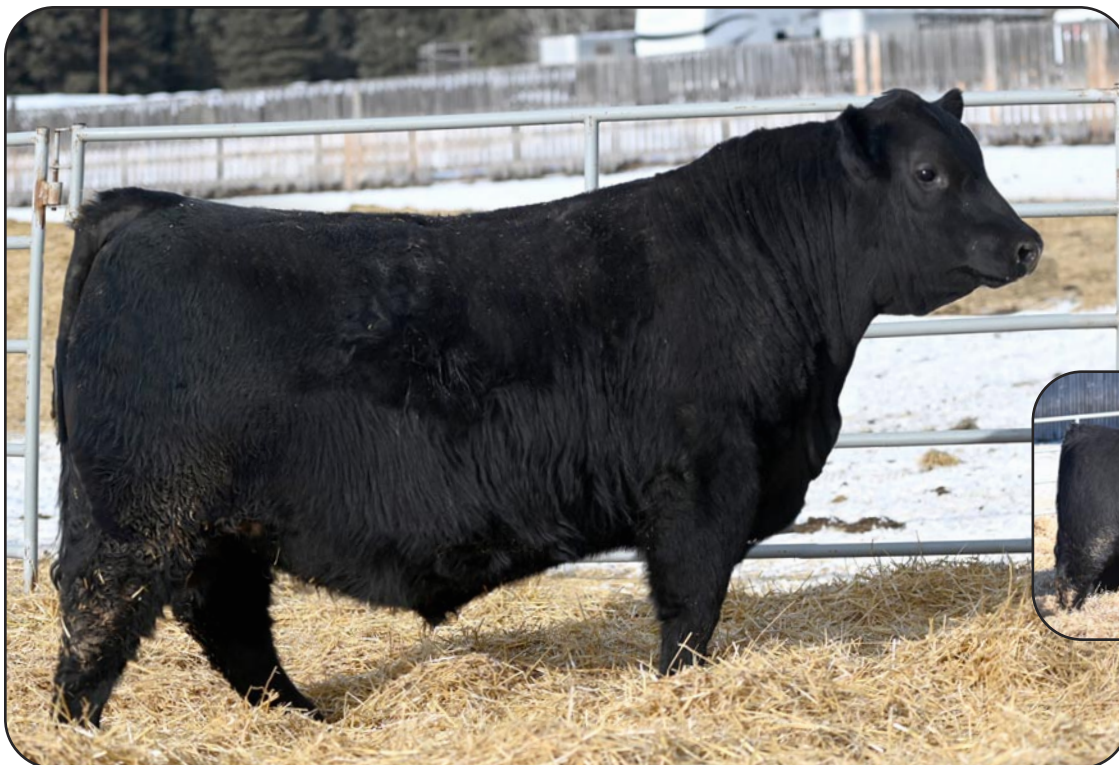
RIVERSTONE VEGAS 14K Paternal Brother to Lots 6-12

7 PUREBRED ANGUS JAN 27, 2023 • TCM 71L • REG#2325784