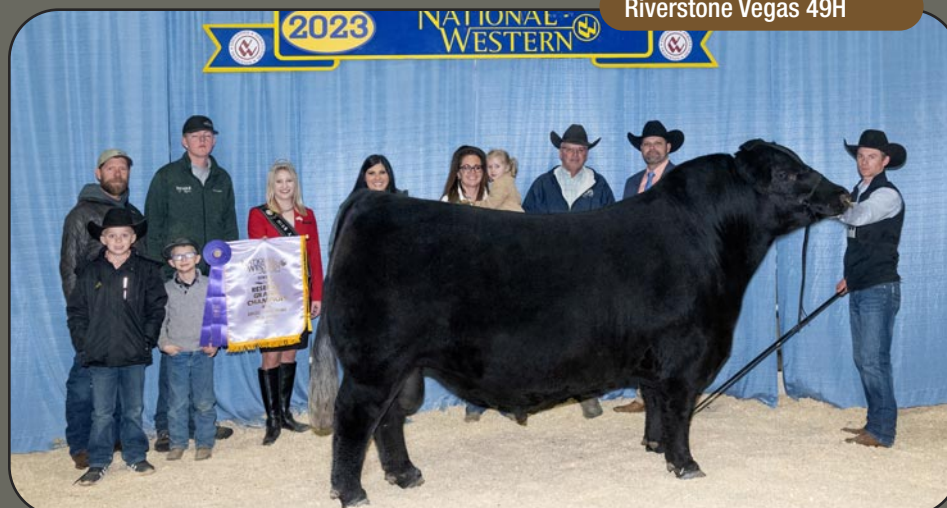
Riverstone Vegas 49H

Riverstone Vegas has definitely made a name for himself in the couple years. Vegas was the high seller in our 2021 bull sale and was purchased by Six Mile Ranch. This bull has since made a massive impact south of the border and is now being used and in part ownership with some of the best breeders in the business. His outcross pedigree makes him a unique to alot of the Angus breeds most popular females.