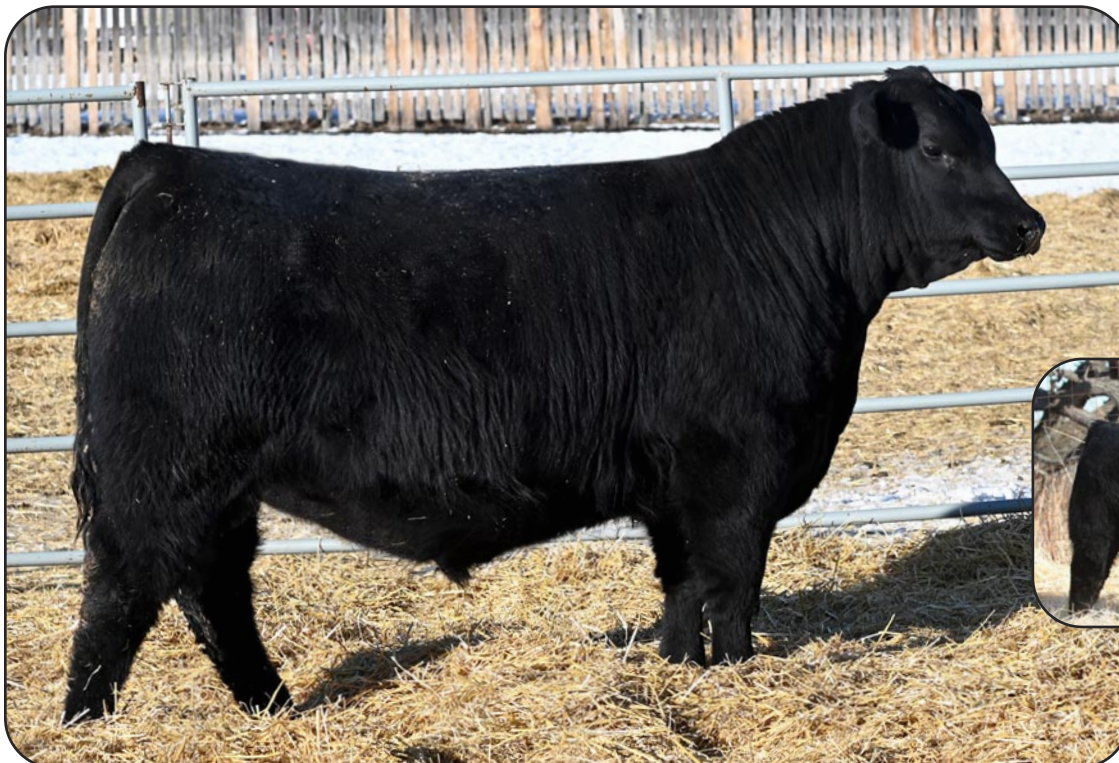
SIX MILE SIN CITY Paternal Brother to Lots 6-12

CFCC BLACK JACK 001 MALSONS SAVANNAH 27Y COLEMAN CHARLO 0256 COLEMAN DIXIE ERICA 1342 S A V RESOURCE 1441 HIGHLAND EVENING TINGE 8T D.S. MARVEL 901W HIGHLAND BLACKBIRD 6S