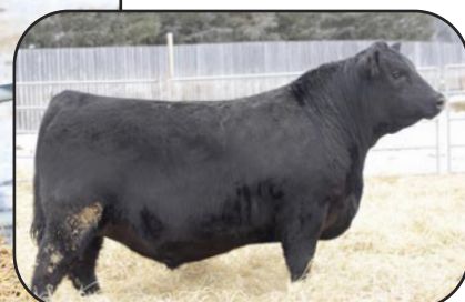
RIVERSTONE PRESIDENT 48J Maternal Brother to Lot 20