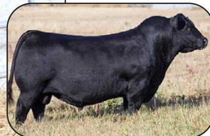
BROOKING BANK NOTE 4040 Maternal Grandsire to Lot 13