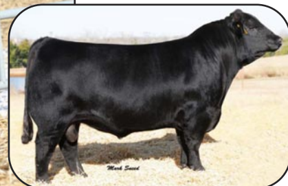
SALT CREEK BOB 7003 Maternal Grandsire to Lot 10