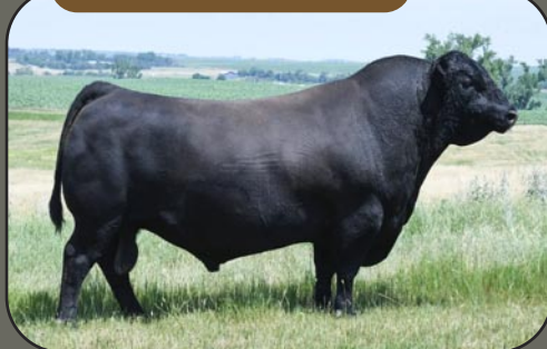
SAV One Nation 9558

One Nation is the impressive President son from the 2020 SAV sale where he was selected for his completeness and built in cow power with calving ease credentials. In the Canadian database, One Nation is in the top 5% for CED and top 10% for BW, making him an obvious choice for the heifer pen but he maintains a YW EPD in the top 6% so you're not sacrificing any performance on cows.