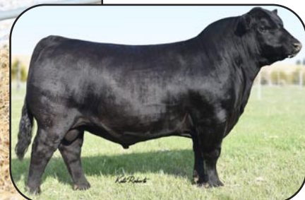
KR CASINO Paternal Grand sire to Lots 6 - 15