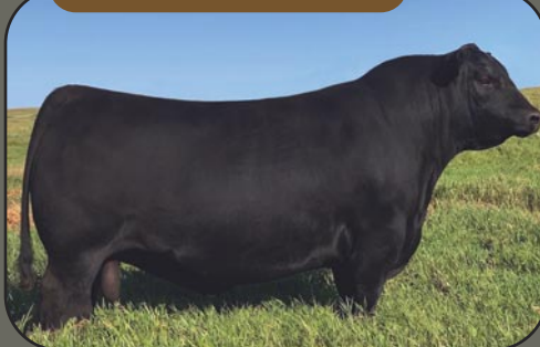
SAV America 8018

SAV America 8018 is the $1,887,500 valuation all-time, top-selling, world-record son of President. He literally shattered every record including the all-time record at Schaff Angus Valley for 205-day weight at 1107 pounds and the most money ever paid for a bull in history, selling for 80% semen interest at 1.51 million dollars. He is a "one of a kind" breeding piece, resulting from the last embryo produced out of the legendary SAV Madame Pride 0075, who has produced over $5.5 million dollars in progeny sales to date. America is truly unique.