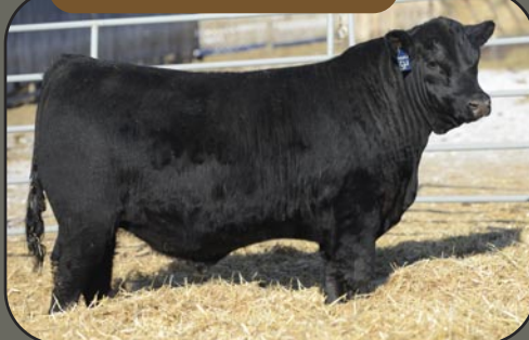
Riverstone Road House 42H

Riverstone Road House 42H is a full brother to the 2023 Reserve Grand Champion Bull at the National Western, Riverstone Vegas 49H. When we were deciding which of the full brothers to keep for ourselves as a walking bull we chose this bull because of his lighter birth weight that could be used on heifers. Unfortunately we lost this bull to an injury and we only had a handful of semen drawn on him. He is a sire in short supply and we will miss him in our program.