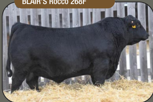
BLAIR'S Rocco 268F

Rocco is sired by the ultimate female producer, SAV Renown, by the extreme producer and phenotype queen Bar-E-L Erica 74A. Rocco is a brute force loaded with real breed charter, tons of red meat, superior spring and depth of rib, deep long muscle, and stands on a perfect foot. Maternal is bred into Rocco topline and bottom side of his pedigree.