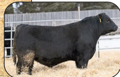
RIVERSTONE GRAZER 70K Maternal Brother to Lot 18