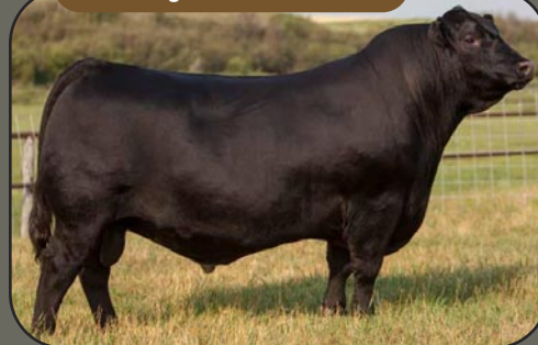
Brooking Emerald 9179

When Brooking Emerald sold in the historic Rose Bowl sale, we at Riverstone, were one of the limited group of breeders to purchase his rights that sold for $94,000 that day. He is muscular, masculine, deep ribbed, with an abundance of shape in his hip. He is excellent footed with an even balance of weight distribution from his front to back and sould moving. Booking lost this bull last year so his progeny will become more valuable and limited.