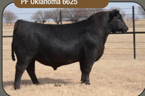
PF Oklahoma 6625

PF Oklahoma 6625 is one of the most complete calving ease bulls with maternal greatness and stacked EPD's in the breed. He is strong footed, sound structured, large scrotal, smooth made and nearly impossible to find a hole in for an exciting up and coming calving ease prospect. Genetically, he is intriguing by representing two of the great cow families in the industry with the Rita on the top side and the world renowned Henrietta Pride on the bottom side.