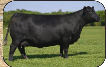
SAV MADAME PRIDE 0151 Paternal Granddam to Lots 3 & 4