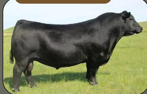
SAV President 6847

SAV President 6847 was the world record and top-selling bull of the 2017 SAV sale at $750,000 with a total valuation of $938,500. Incredible in his structure and powerful in his design, President is been called the best Charlo son out of the No. 1 income producing cow in SAV history, SAV Blackcap May 4136. To date, she has produced over $10 million dollars in progeny sales. Thick and efficient, he is the future of performance Angus genetics.