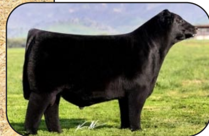
COLBURN PRIMO 5153 Maternal Grand sire to Lot 15