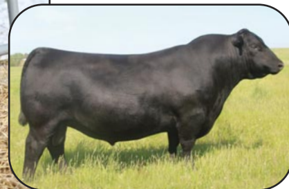
SAV RAINFALL 6846 Maternal Grandsire to Lot 22