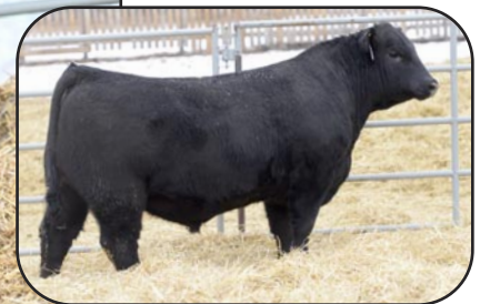
RIVERSTONE OKLAHOMA 28J Maternal Brother to Lot 27