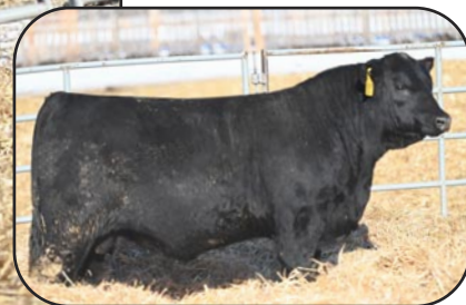
RIVERSTONE NATIONAL 35K Paternal Brother to Lot 21